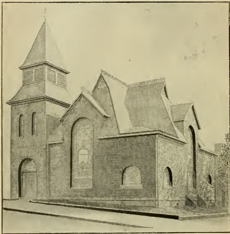
BAPTIST CHURCH, WADESBORO.